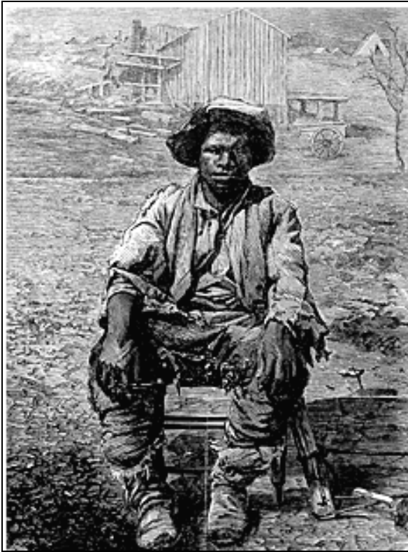
Gabriel Prosser 1800